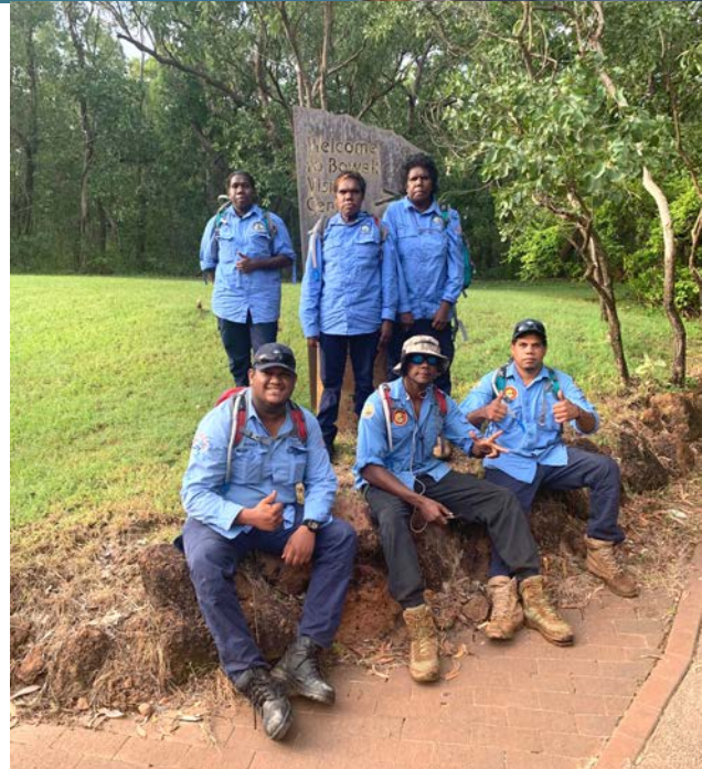
First day in Kakadu

2021 training focus is on the Conservation Land Management Certificate. Early March seven of our Anindilyakwa Ranger's boarded a two hour direct charter flight from Groote to Jabiru to attend the Charles Darwin University Ranger workshops. The workshop consisted of a number of ranger groups from all around the Northern Territory, along with trainers from CDU. The workshops ran over four days starting with an opportunity to meet other ranger groups and discuss our local programs. The remaining time was spent on both theory and practical training which included how to ride and maintain quad bikes, side-by-side and small motor usage, successfully completing Units towards their Qualification