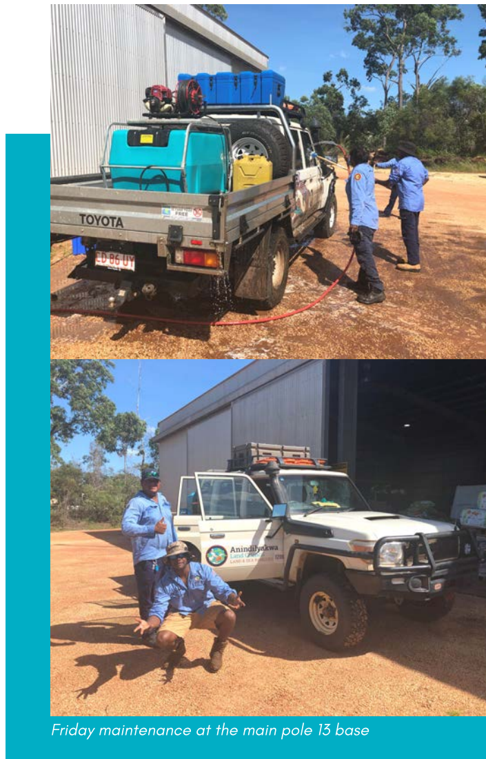
Friday maintenance at the main pole 13 base

Types of maintenances include, checking vehicles, cleaning our sheds and main buildings, maintaining the grounds, checking equipment such as chainsaws, charging batteries for the power equipment. We also top up petrol, diesel and gas, purchase and prepare food to cater for trips and lunches. These are just a few of the daily duties needed to run our program successfully.