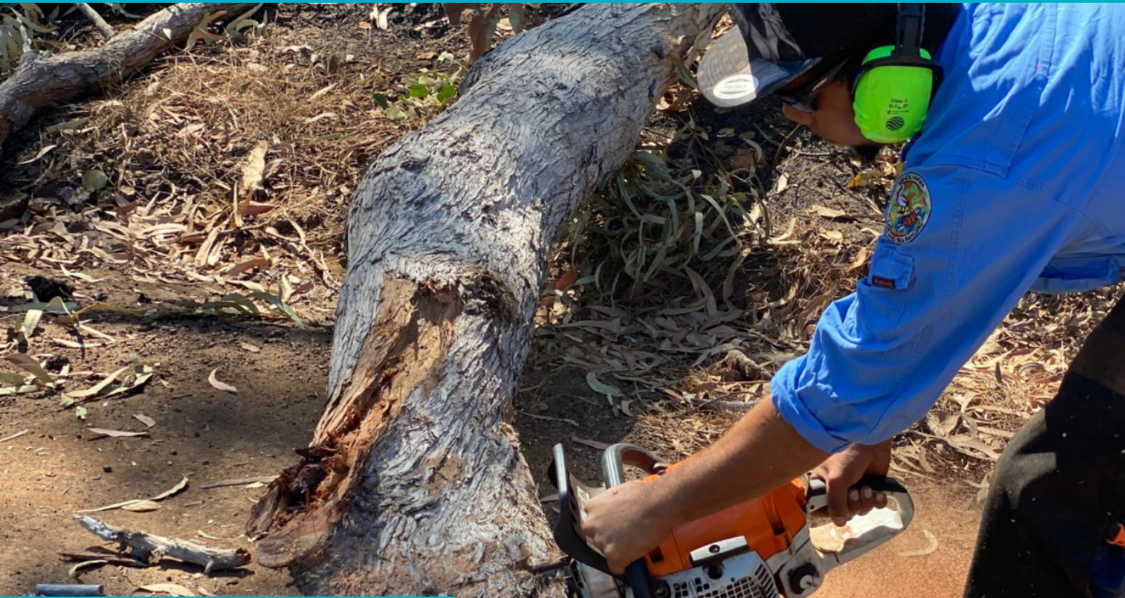
Cutting trees on country