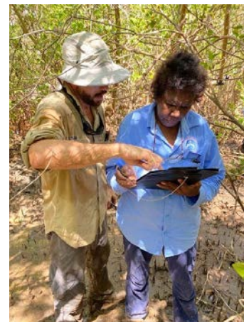
Rangers working in the mangroves