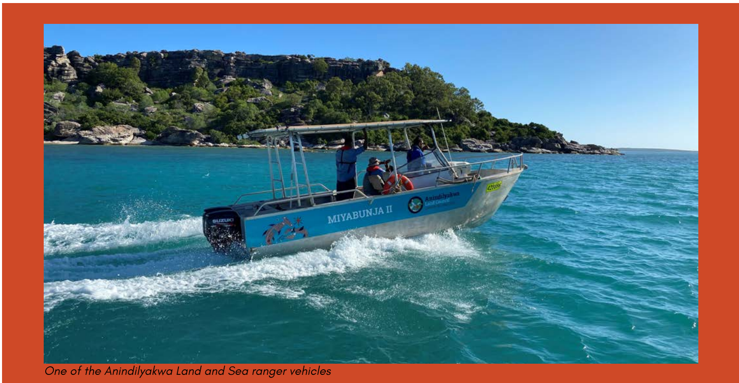
One of the Anindilyakwa Land and Sea ranger vehicles