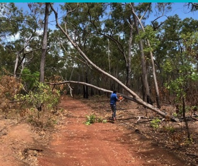
Rangers clearing tracks out on country