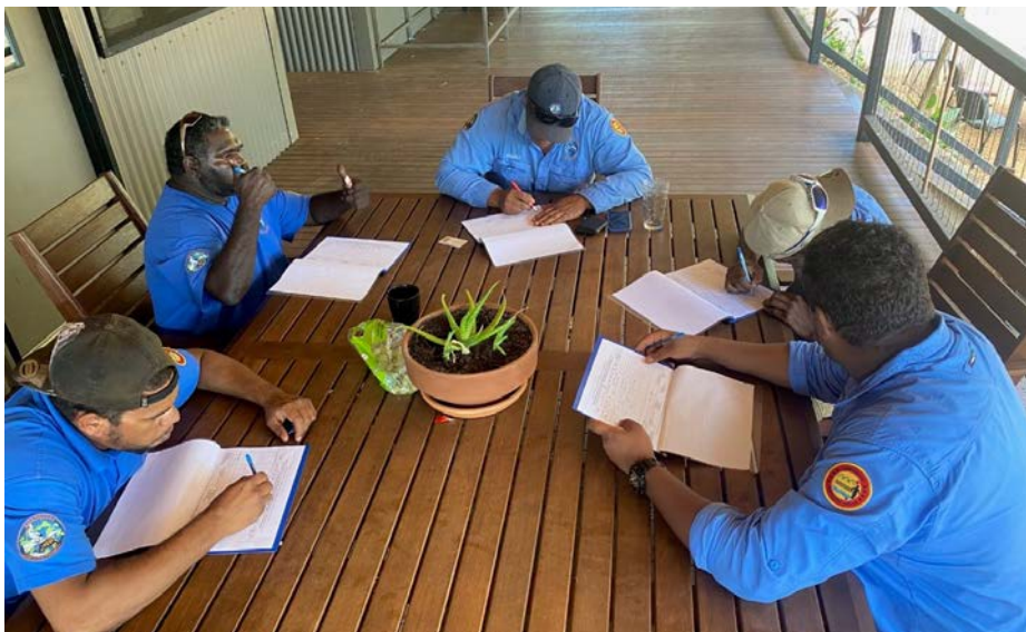
The Rangers doing theory work on their certificate studies