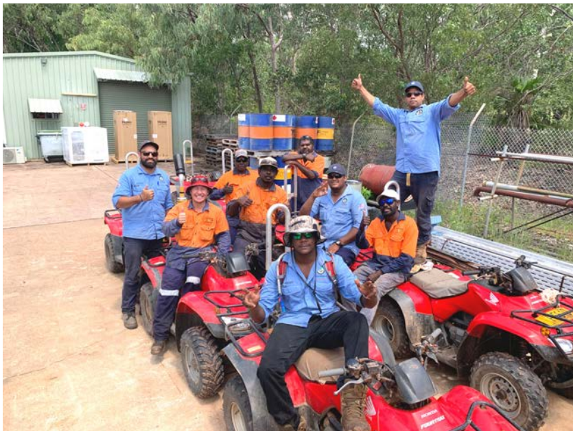
Anindilyakwa rangers with other ranger teams